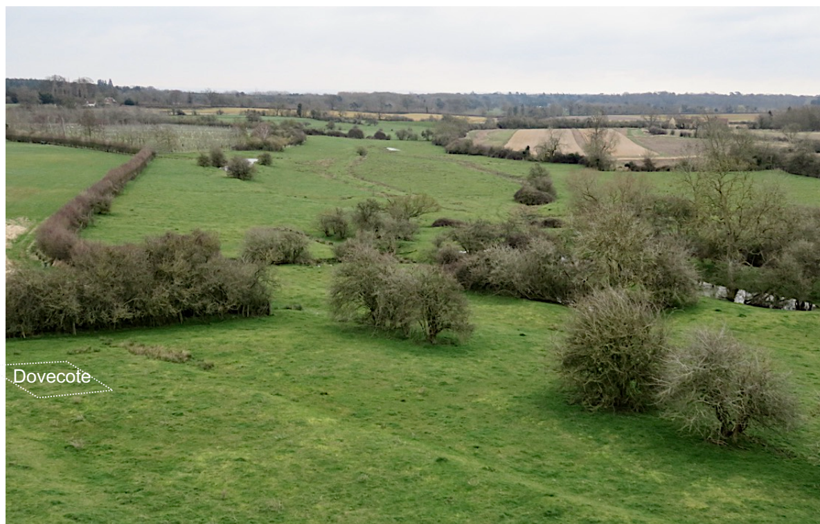
Figure 2 Looking east, view from the manor house over the former monastic precinct.

(2017). 18 Nevertheless, other than the loss of a dovecote, the splendid view over the former monastic precinct from the main wing remains little changed (Figure 2).