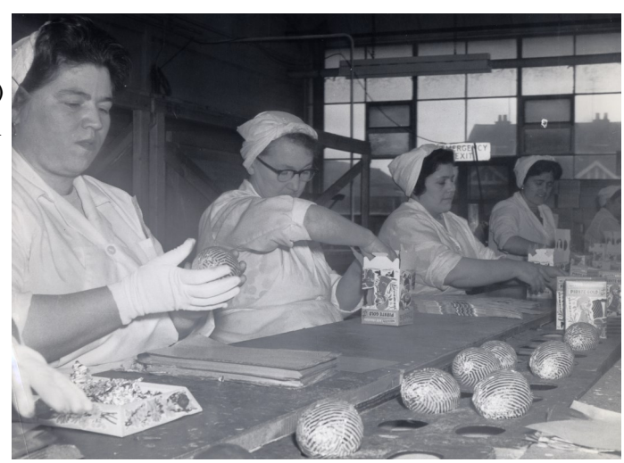
Ladies packing Easter Eggs in the Meltis factory [ref: X853/30/4/2].

Bedfordshire Archives will be holding a stall featuring a small exhibition about the tradition of Easter eggs and a look at the archives of the confectioners Meltis which are held in our collection [ref: X853]. Meltis became one of Bedford's best known employers and their confectionery was known across the country featuring the delights of glacé fruits, peppermint creams, Turkish delight and much more.