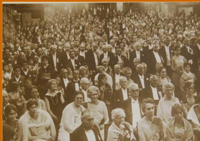
日本工業倶楽部 • 日本經濟聯盟聯合夜會 日本舞踊に蕩醉する海外會員 (十月三十日 日本工業倶楽部)

Evening Party by the Industry Club of Japan and the Japan Economic Federation.