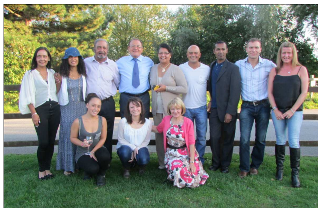
Family reunion in September 2013