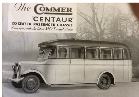
Right: [Ref: GK296/9] Printed and Illustrated Brochure of Commer Cars Ltd of Luton, c.1933