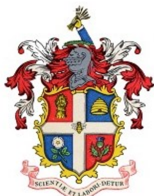
COUNTY BOROUGH OF LUTON MOTTO. Scientiae et labori detur—"Due to knowledge and labour."