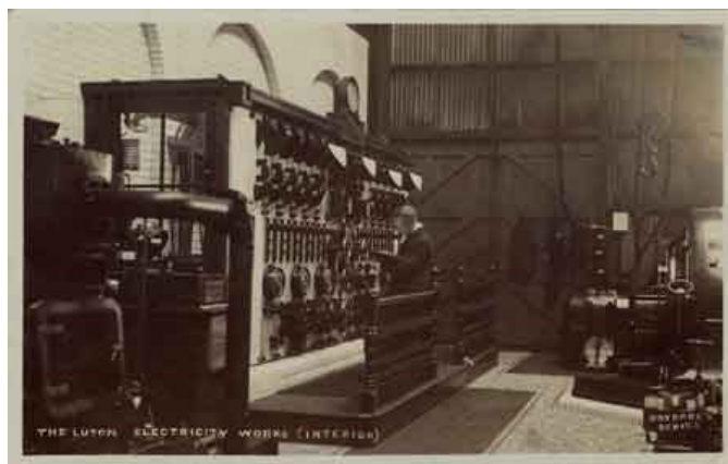
Luton Electricity Works, 1909 [Ref: Z1306/75/17/11]